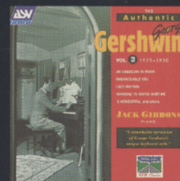
Vol. Two: 1925–1930 WHL 2077