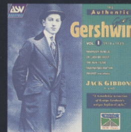
Vol. One: 1918–1925 WHL 2074

N.B. This concert will begin at 7pm and end at approx. 10pm. There will be two intervals